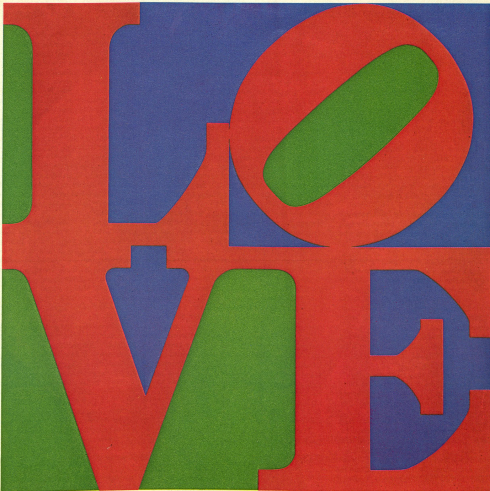
"LOVE" by Robert Indiana. The six foot square canvas is in the permanent collection of the Indianapolis Museum of Art.